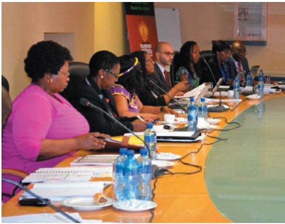
Members of the Forum for Institutions Supporting Democracy deliberating on key strategic issues